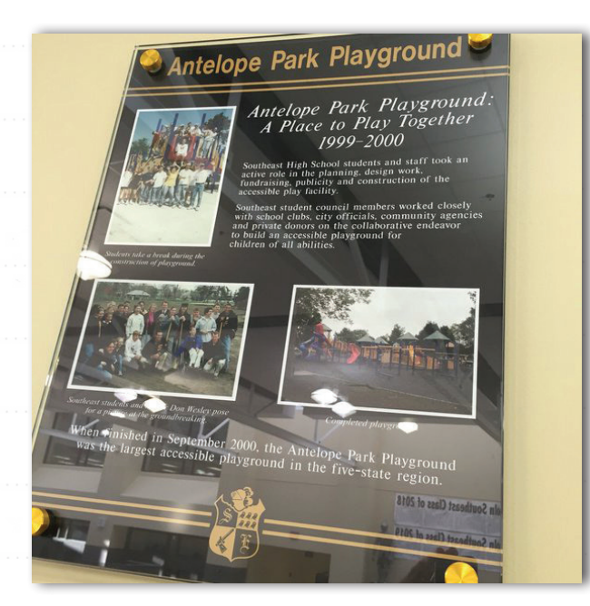
Southeast High School's Community Service Recognition Wall

If you attended Lincoln Southeast High School today, chances are you would graduate with a deep understanding of and appreciation for community service.